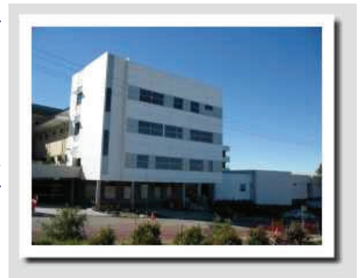
South Block from Platt Street

These works will commence very soon and we will advise when the parking is available.