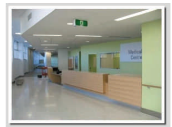
Level 3 Medical Centre

To find out more, visit www.honeywell.com/buildingsolutions